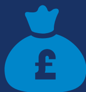
Figure 6: In which, if any, of the following ways do you think you or members of your family are disadvantaged? Base: 2002